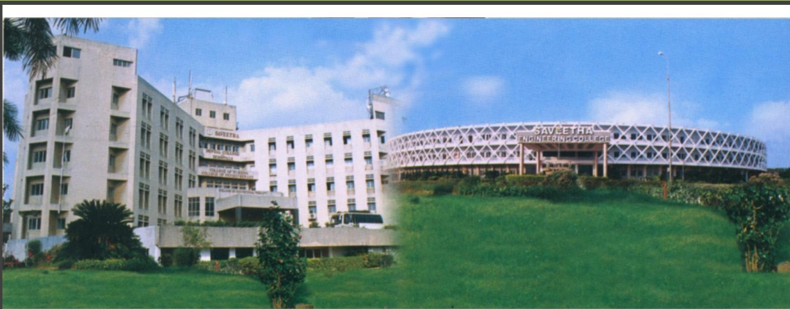
Saveetha Dental College & Saveetha Engineering College.