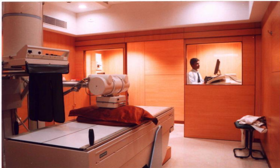
BHARAT SCANS , ANNANAGAR