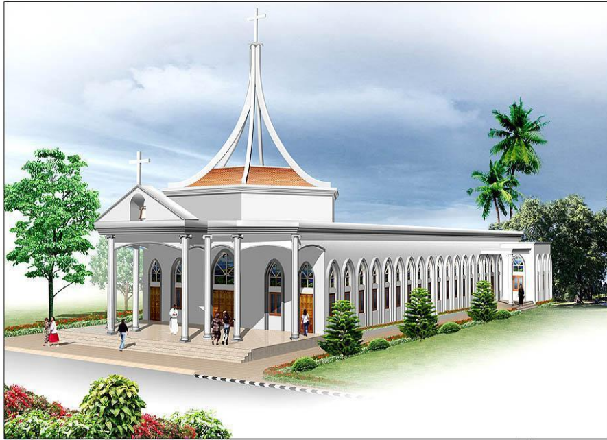
Project : Proposed Community Hall at Ranipet.