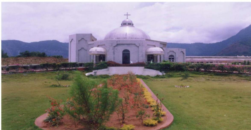
BETHESDA PRAYER CENTRE - COIMBATORE .