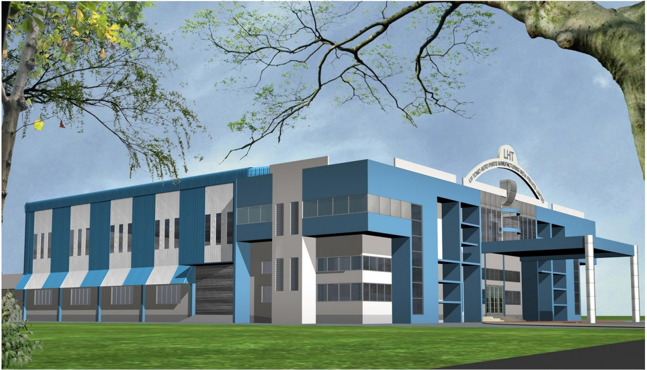
Proposed FACTORY at Sengadu Village, Wallaja Taluk, WALAJAH, VELLORE Dist.