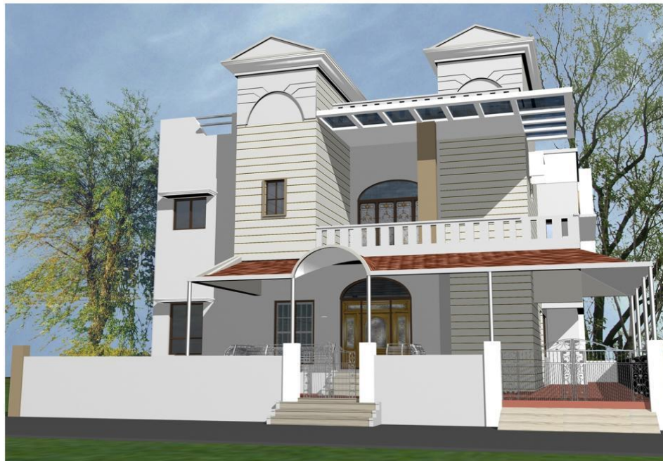
Proposed Residence at Kodambakkam, Chennai.

KINGSWAY CONSULTANTS Architects & Engineers No-13 Jarret Gardens, Casa Major R Egmore, Chennai - 600 008. Ph: 044 - 3022 4444, 2819 3832, 281