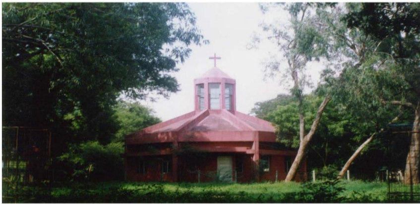
YMCA COLLEGE OF PHYSICAL EDUCATION CHAPEL - CHENNAI .