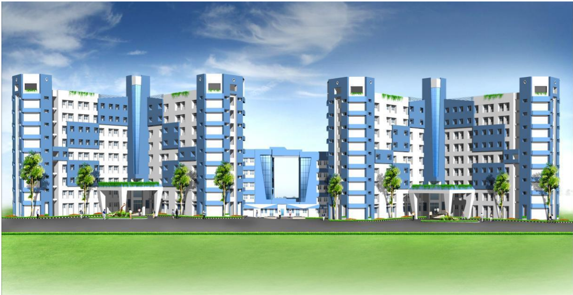
Project : Proposed Gents Hostel-H Block Vellore Institute of Technology at Vellore.