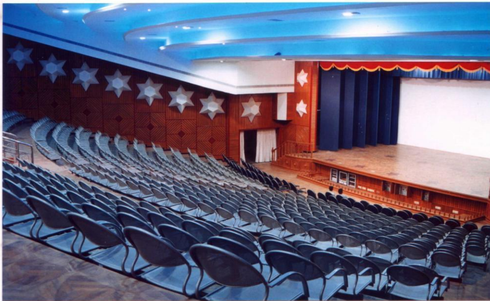
AUDITORIUM - SAVEETHA DENTAL COLLEGE